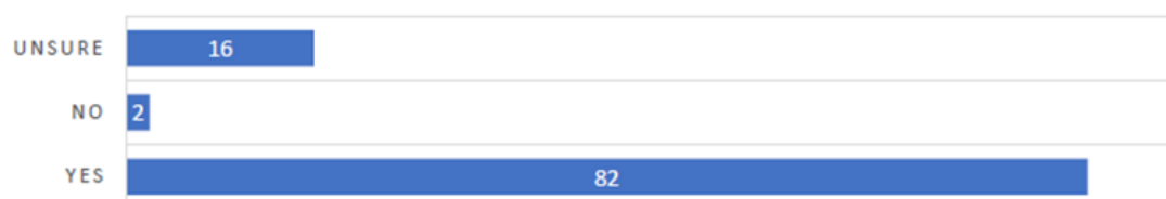
Figure 2. Would You be Willing to adopt agroforestry practices in your cocoa farms?

Almost all the respondents (100 respondents) showed a particularly favourable perception about the role of agroforestry in cocoa production. Members of the communities further showed increased awareness of multiple benefits of agroforestry in cocoa systems. Analysis of the data from the study showed that significant number of research participants (82 out of 100) were willing to plant and integrate trees into their cocoa production systems because of several benefits. These benefits could be broadly categorised into three: (i) local/personal benefits (ii) farm-supportive benefits and (iii) global/microclimate benefits (See fig. 2).