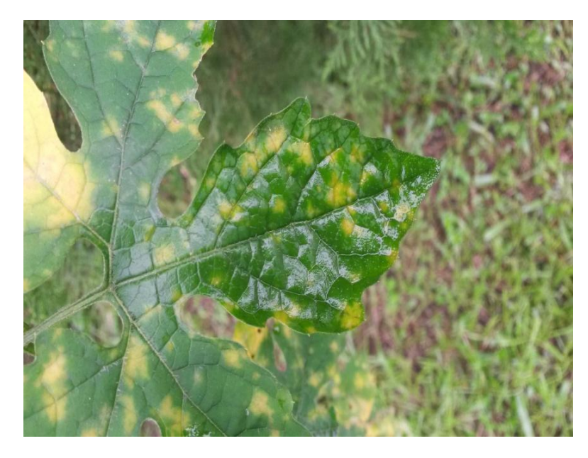
Fig. 1. Chlorotic spots on Momordica charantia

(hexadecetyltrimethylammonium bromide); and 0.4% β- mercaptoethanol, added just before use. Each of the homogenates was poured into a new 1.5 ml Eppendorf tube. The tubes were vortexed briefly, incubated in a 60°C water bath for 10 minutes and allowed to cool to room temperature. Then 0.75 ml of phenol choloform isoamyl (25:24:1) was added to each tube containing the homogenate. Each tube was then vortexed vigorously to form an emulsion and then centrifuged at the speed of 12000 rcf for 10 minutes. The supernatant was then transferred to a clean 1.5 ml tube. Three hundred of cold isopropanol was added to the supernatant to precipitate the nucleic acid (RNA) and the mixture was kept at -80°C for 10 minutes. The mixture was centrifuged at 12,000 rcf for 10 min to precipitate the nucleic acid. The supernatant was discarded and the nucleic acid pellet washed in 500 µl of 70% ethanol and centrifuged at 12,000 rcf for 5-10 minutes. The supernatant was decanted and the resultant nucleic acid pellet was air-dried at room temperature. Nucleic acid pellet was then re-suspended in 50 µl sterile distilled water and used as a template source for reversed transcriptase polymerase chain reaction (RT-PCR). Nucleic acid extracts from the leaves of healthy plants were used as negative control.