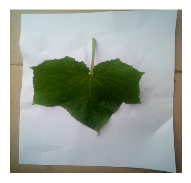
Fig. 3. Cucumber leaf showing no symptoms

Etim and Okon; ARRB, 36(12): 51-58, 2021; Article no.ARRB.77419