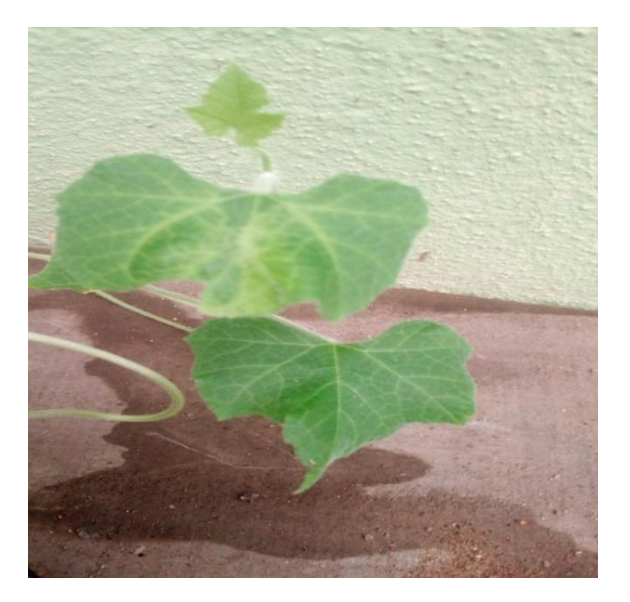
Fig. 4. Mosaic symptoms on cucumber