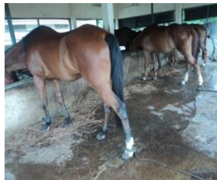
Fig. 14. Concrete floor

physiological and pathological reasons like oxidative stress and inflammatory responses occurring within the hoof microenvironment [20]. Non-significant differences were found in case of neutrophil, eosinophil and basophil both in summer and winter, however highly significant ( P < 0.01 ) increase was found between the mean values of lymphocyte and monocyte both in summer and winter seasons. Whereas, when