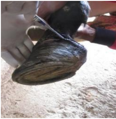
Fig. 9. Quittor