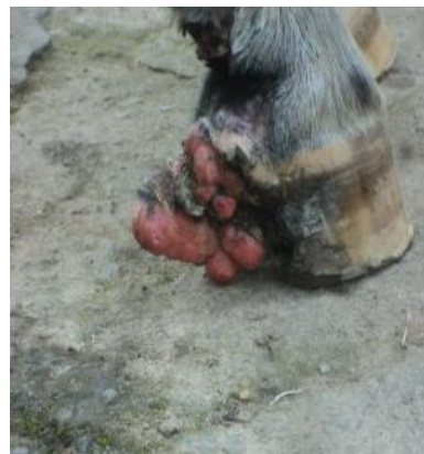
Fig. 12. Bulb fibroma