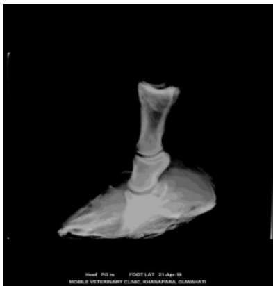
Fig. 11. Laminitis (3rd phalanx rotation)