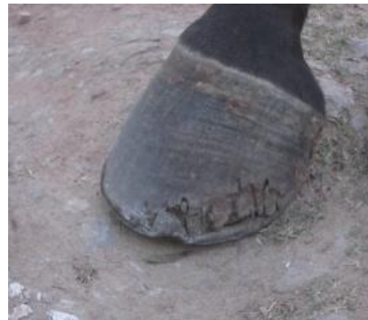
Fig. 6. Hoof wall crack