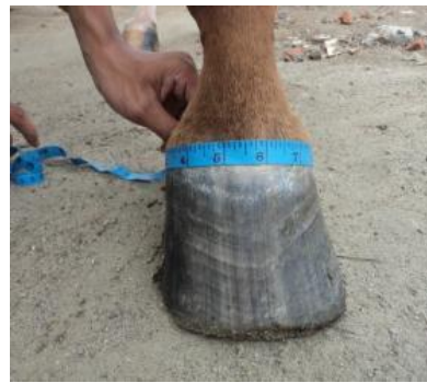
Fig. 4. Measuring of coronary band