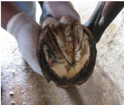
Fig. 5. Hoof overgrowth