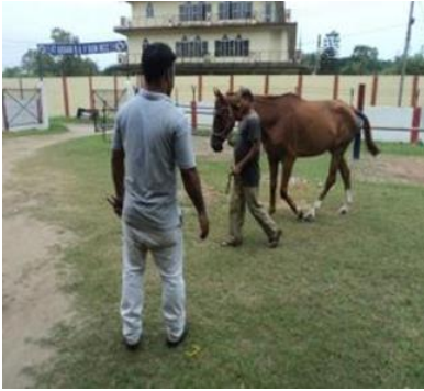
Fig. 1. Lame horse subjected to walk