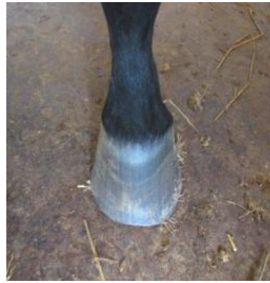
Fig. 10. Laminitis showing circular rings on hoof wall