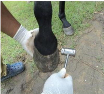
Fig. 3. Percussion of hoof