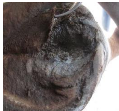
Fig. 8. Suppurative sole