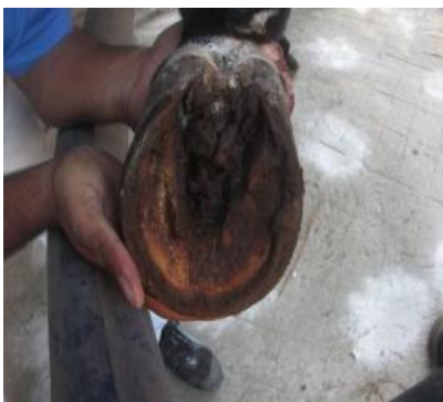
Fig. 7. Thrush