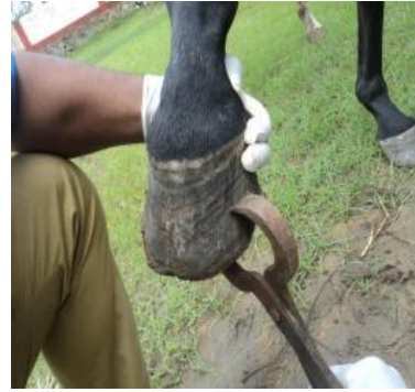
Fig. 2. Application of hoof tester