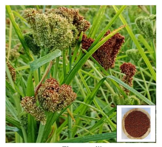
a. Finger millet