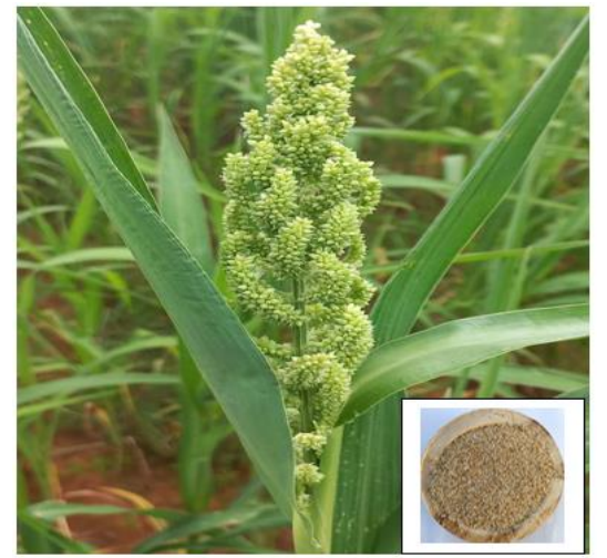
e. Barnyard millet