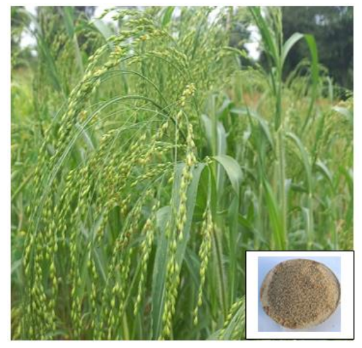
f. Little millet