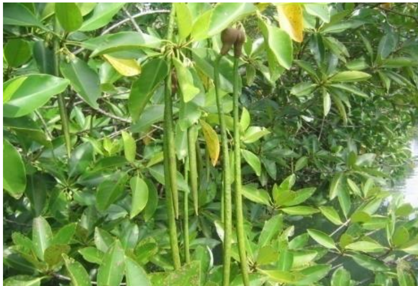
Plate 1. Rhizophora sp.