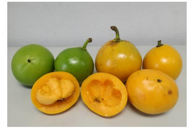
Fig. 1. The fruits of G. xanthochymus

pedicel length of 1.8-3 centimeters. The fruit is green in color, broadly ovoid to spherical, with a smooth surface that ripens to a dark yellow color (Fig. 1). The interior of the fruit is juicy and contains yellow latex, with 3-5 seeds present [1-31. This plant has been used in various traditional medicines for the treatment of diarrhea. dysentery, nausea, vomiting, and skin diseases There manv phytochemical [4-5]. are constituents that can be found and extracted from G. xanthochymus, including benzophenones. flavonoids. xanthones. isocoumarins, and depsidones [4]. Furthermore, this plant exhibits a variety of pharmacological activities such as antioxidant, antiinflammatory, antidiabetic, and antimicrobial properties [4-6].