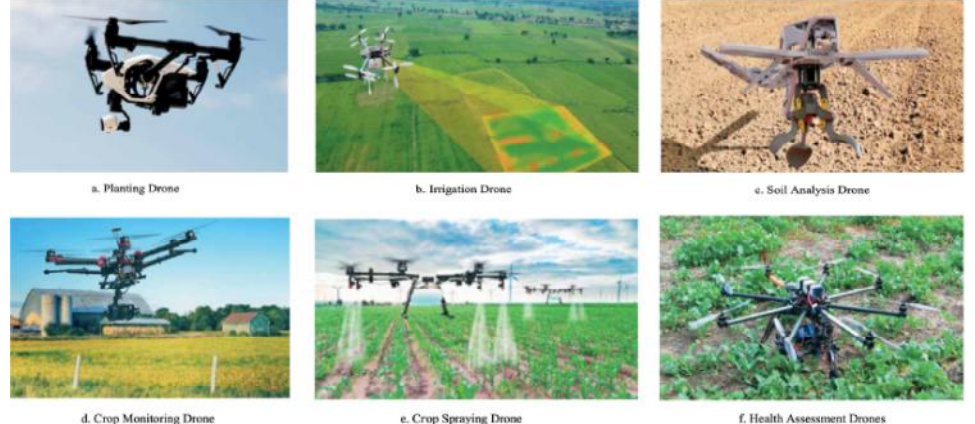
d. Crop Monitoring Drone

Companies design and programmed autonomous robots to perform critical agricultural tasks at a higher volume and faster speed than humans, such as weed control, planting seeds, harvesting, environmental monitoring and soil analysis.