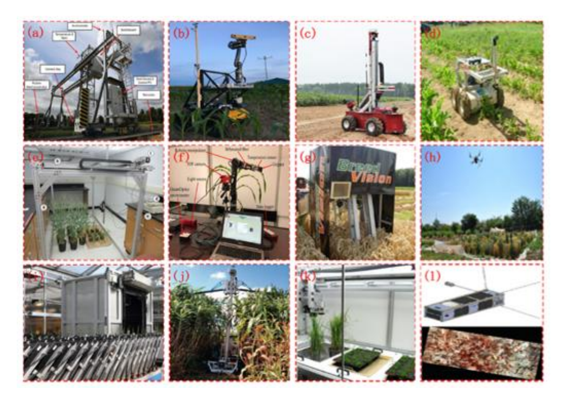
Fig. 2. Different sensor platforms for crop phenotyping: (a) robotic field platform [51] (b) Robotic platform [45], (c) Ground based platform [52] (d) Robotic platform with artificial vision [53], (e) Ground based platform [54] (f) Robotic platform [55] (g) Robotic based platform [56] (h) UAV platform [57] (i) Robotic platform [58] (j) Robotic platform [59] (k) Robotic platform [60] (l) Robotic platform [61]

irrigation systems. A sensor-based smart irrigation system for efficient water use has been developed by many businesses with the aid of advanced technology. In this system, soil moisture and temperature sensors interact directly with embedded components on the field and take care of required water distribution among crops without farmer's interaction. This system helps maintain the desired soil and the optimum water range for plant growth in the root zone. Jha et al. [62] have also developed an automated irrigation system with Arduino technology to decrease human power and time consumption in the irrigation process. The concept of an effective and automated irrigation system was also created by Savitha and Uma Maheshwari [63] by developing remote sensors using Arduino's technology that can increase output by up to 40 percent. One of the many technologies used to measure the quality of soil moisture is used by soil moisture sensors. It is buried near the crop root areas [64]. assist in assessing The sensors the moisture level accurately and relay this reading to the irrigation controller. Sensors for soil