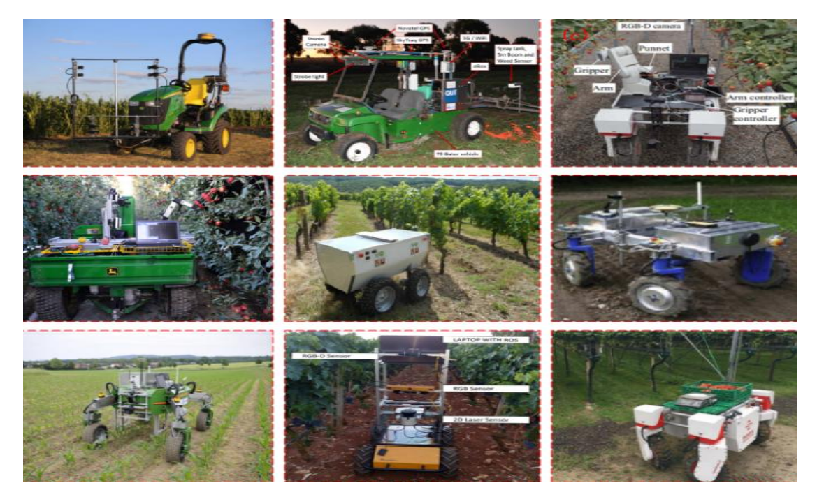
Fig. 1. Autonomous mobile robots that are used in precision farming. Fig. (a) Robotic Phenotypin [31]; (b) Agricultural robot [32]; (c) Strawberry harvesting Robot [33]; (d) Autonomous Robot (e) Robotic Apple Harvester [34]; (f) Autonomous Agriculture Robot "Vinebot" [35]; (g) Agriculture Robot Use in Field [36]; (h) Weed Removing Robot [37]; (i) Autonomous Agriculture Robot "BoniRob" [38]; (j) Agricultual Vehicle Robot [39]; (k) Agriculture Robot [40]; (l) Agriculture spraying robot [41]

A device comprising five sensors, i.e. ultrasonic distance sensors, thermal infrared radiometers, NDVI sensors, portable spectrometers, and RGB web cameras for high-throughput phenotyping in plant breeding was shown by Bai et al. [30]. These multiple sensors were used to measure crop canopy characteristics from the field plot, GPS was used to geo-refer the sensor measurements and two environmental sensors (a solar radiation sensor and air temperature/relative humidity sensor) were integrated to collect simultaneous environmental data. In the field tests, the results obtained from the soybean and wheat fields using the performance of the sensor system were satisfactory and robust.