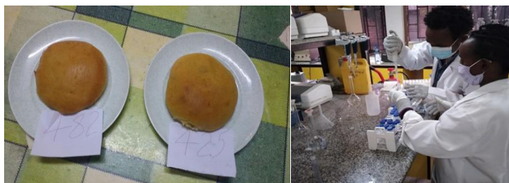
Fig. 1. Bread baking and nutritional analysis

wheat (60), sorghum (30%) and OFSP (10%). Accordingly, the study designed has been summarized in Table 1.