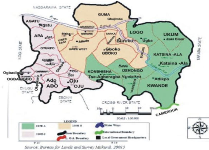
Fig. 1. Map of Benue State showing distribution of local government areas by zones

responses. The validity and reliability of the questionnaire was tested by experts in the field of Sociology in the Department of Sociology from Benue State University, Makurdi. Descriptive statistics such as: frequency count and percentages were used to achieve the objectives of the study, while inferential statistic; multiple regression analysis was used to test the hypothesis of the study.