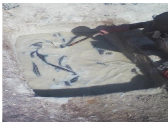
Photo 2. Liming water