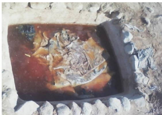
Photo 1. Soaking water