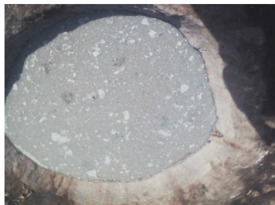
Photo 4. Vegetable tanning water