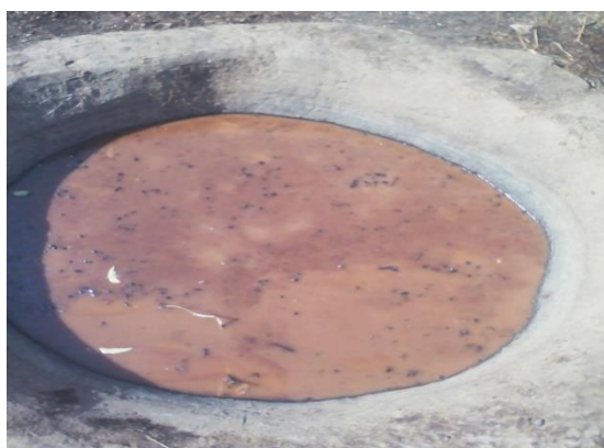
Photo 3. Water of deliming