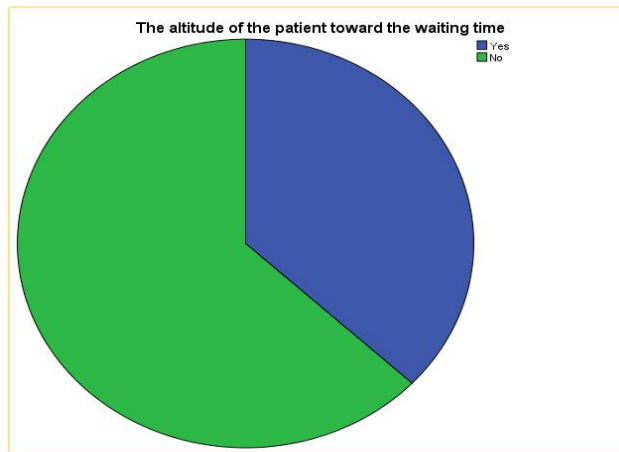
Fig. 2. Attitude of the respondents towards the waiting time