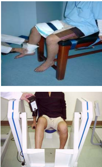
Fig. 3. Testing of patellar-tendon muscle torque electromechanical dynamometer connected to leg-press machine (3540 Leg-press machine - HUR)

The patellar tendon muscle torque was measured using electromechanical dynamometer connected to leg press machine (3540 leg press HUR, Kokkola, Finland) through sensor attachments on the foot plate. Subjects were sitting on the machine with back in upright position, knee at 60° of flexion and the foot supported in neutral position on the foot plate. Fixation was ensured by grasping the hand supports on both sides. Patient applied force onto the foot plate with the affected leg by pushing the lever arm away. Electromechanical dynamometer measured the force of maximum torque of quadriceps muscle which was applied in the patella by maximum pushing of the lever arm (Fig. 3).