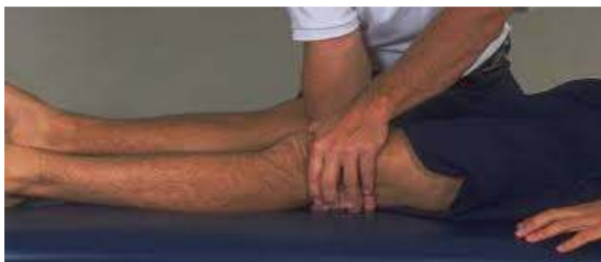
Fig 2. Knee grind test