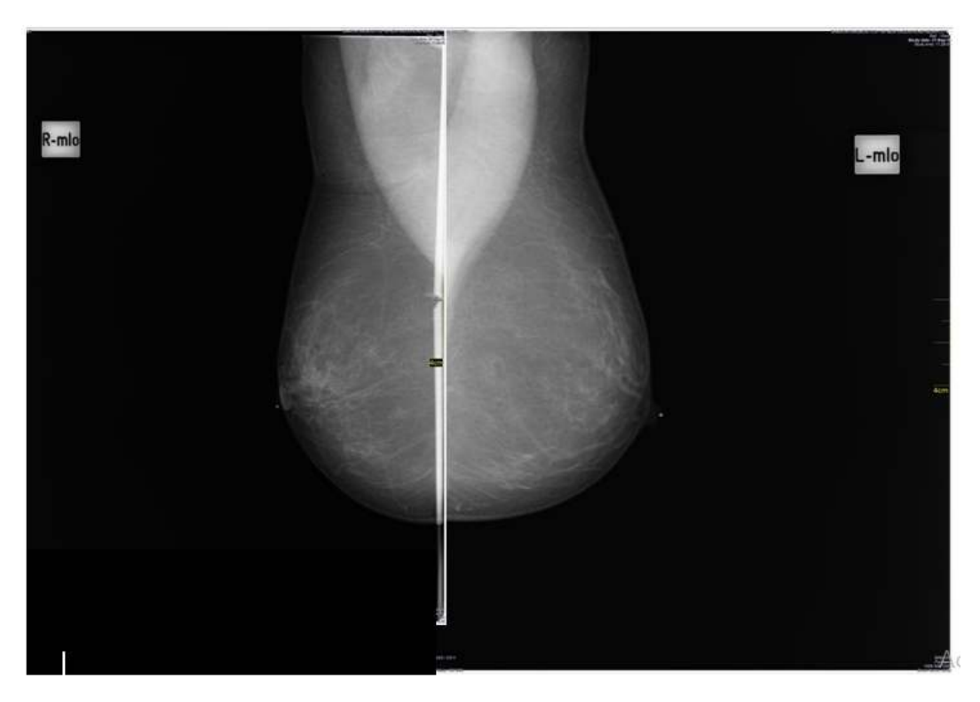
Fig. 1B. MLO views of a normal mammogram