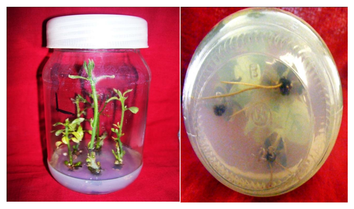
Figure 3. The in vitro adventitious root induction Litsea glutinosa, root formation on semi-solid MS medium with 10 µM IBA at 30 days after inoculation.

sand beds in the mistchamber and the plantlets were covered with culture bottles to maintain humidity (Figure 4a).