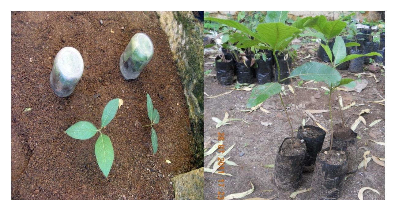
Figure 4. Hardening and acclimatization of the in vitro raised plantlets of Litsea glutinosa , transferred into (a) sand bed covered with culture bottles in mistchamber, (b) growth of plantlets in the open environment.