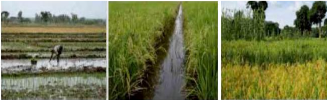
Fig. 1. Rice production systems in Tanzania: Lowland rainfed, irrigated and upland

P availability as extracted from soils by various extractants is expressed in terms of critical ranges, like critical nutrient ranges instead of absolute critical concentration values [38]. Understanding the dynamics and critical P levels in the soils is crucial for predicting their interactions as in turn its activity may regulate P uptake and plant growth in the production systems.