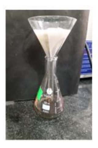
Fig. 1. Preparation of Boerhaavia diffusa extract mediated zinc oxide nanoparticles and the solution of Boerhaavia diffusa in zinc sulphate solution