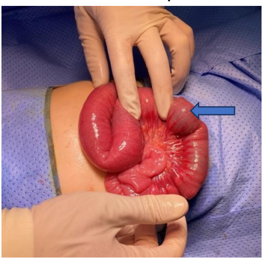
Fig. 3B. Healthy appearing small bowel, with a palpable obstructing mass/foreign body (blue arrow)