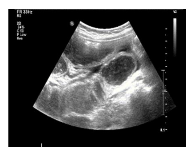
Fig. 1. Ultrasound of the abdomen and pelvis, showing dilated bowel loops