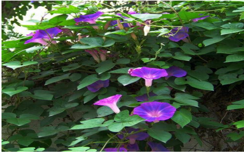
Ipomoea mauritania

with prostrate or ascending stems up to 40 cm height, rooting at the nodes and producing from seeds and stolons [25]. Different parts of the plant are utilized traditionally for medicinal purposes [26]. Phytochemical studies on the leaves revealed the presence of alkaloids, flavanoids, phenols, polyphenols, tannins, cyanogenic glycosides, anthocyanins, saponins, sapoginin cardiac glycosides and anthraquinone [20]. The leaves are used in the treatment of diarrhea [26]. According to Ofor [27], Heterotis rotundifolia has antioxidant, anti-ulcer and antibacterial potential as well as high level of retinol, cholecalciferol, tocopherol and thiamine and low in pyridoxine, niacin, riboflavin, ascorbic acid, phylloquinone and cobalamin.