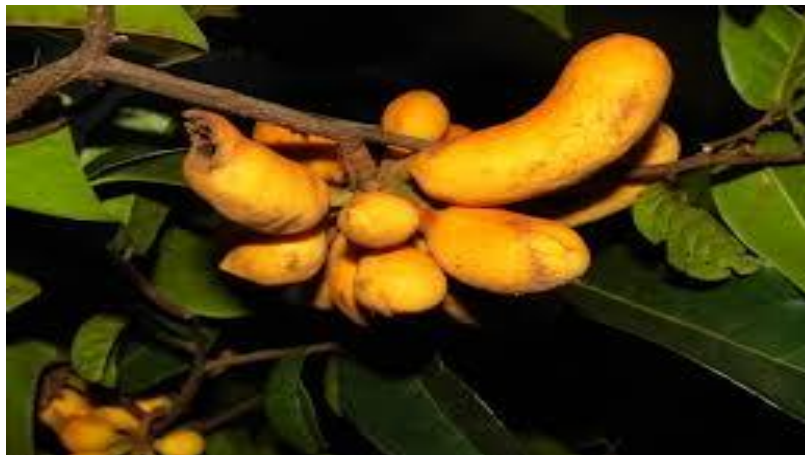
Uvaria chamae Source: Omale et al. [24]