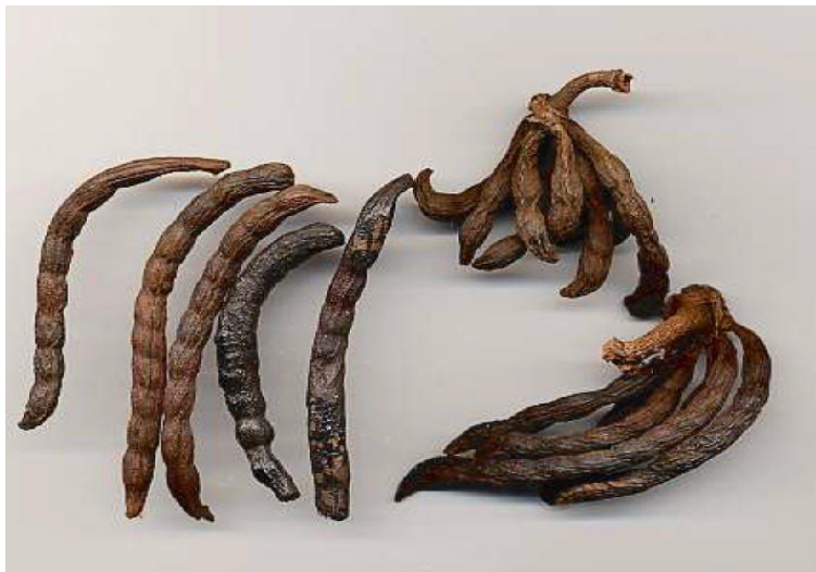
Xylopia aethiopica (Uda)

the Hausa people of Northern Nigeria is a legume in the family Fabaceae . It is a tropical deciduous forest tree with characteristic distinctive four-winged fruits consisting of woody shell, a fleshy pulp and small, brownish-black seeds. The dried fruits are used in flavoring soups, particularly the traditional pepper soup, a delicacy consumed by mothers from the first day of delivery to prevent postpartum contractions, as a lactation aid [15], and for gastrointestinal disorders, especially stomach ulceration. The fruit has varied applications in Nigerian folk medicine and is used extensively for management of many array of human ailments including hypertension, inflammation, arthritis, diabetes mellitus, and epilepsy [16]. The insect repellent property of the fruits has been attributed