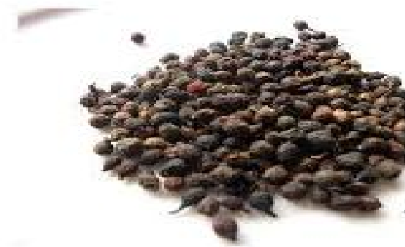
Piper nigrum (Uziza)