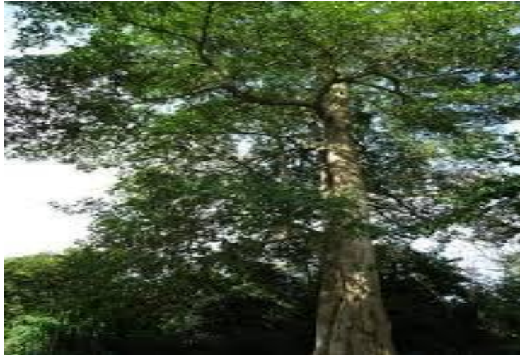
Alstonia boonei Source Obute, [13]