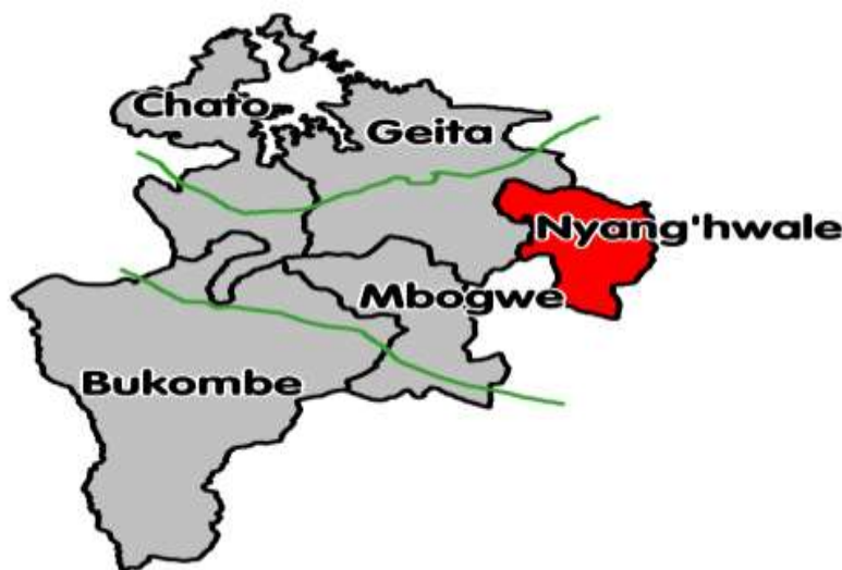
Map 1. Map of Geita region and its 5 districts including nyang'hwale

Shapiro-Wilk did the normality test of the data with the aid of IBM SPSS statistics software. The data is normally distributed because the Shapiro-Wilk indicated the range of 0.002 to 0.021 significant levels. Hence, the researcher accepts the alternative hypothesis that the data are normally distributed because the Shapiro-Wilk significant value is less than the significant critical value of 0.05 [26].