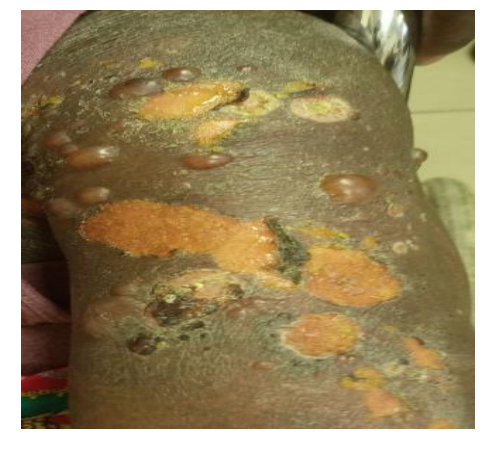
Fig. 1. Bullae and ulcers on the upper arm

skin infection at a peripheral centre but was referred to the dermatologist after a couple of months of being on intravenous antibiotics without any improvement. Initial investigations showed, FBS was 5.2mmol/l and HbA1c was 6.9%. The endocrinologist requested a 2 hour post-prandial test after breakfast be done daily for 1 week which showed the range to 6.8-8.4 mmo/I which was within normal glucose range for his age. Skin punch biopsy initially done was suggestive of psoriasis but the samples left had to be reanalysed and bullae at dermal-epidermal junction was visualized. The clinical diagnosis of bullous pemphigoid was confirmed. Patient was treated with topical 0.05% clobetasol propionate and oral prednisolone 30 mg daily for 3months. The dose of oral prednisolone was later tapered down as patient made significant improvement and went into remission. He was later commenced on azathioprine as the bullae reoccurred and is currently being followed up on outpatient basis.