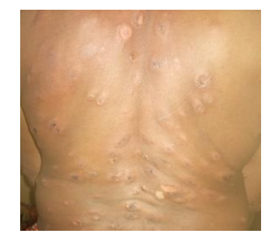
Fig. 4. Bullae, eschar and ulcers on the trunk