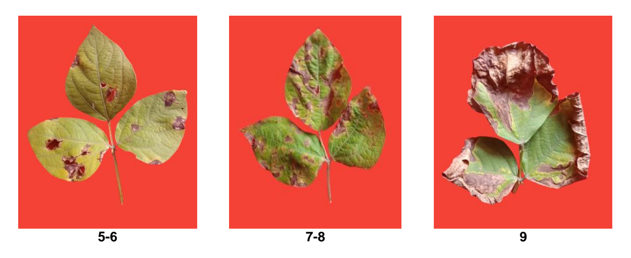
Plate 1. Web blight disease rating scale on mungbean