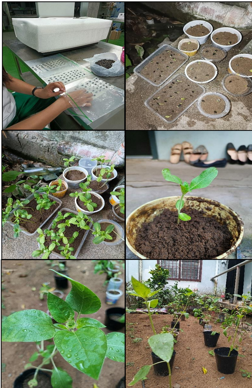
Fig. 2. Cultivation of sunflower sample