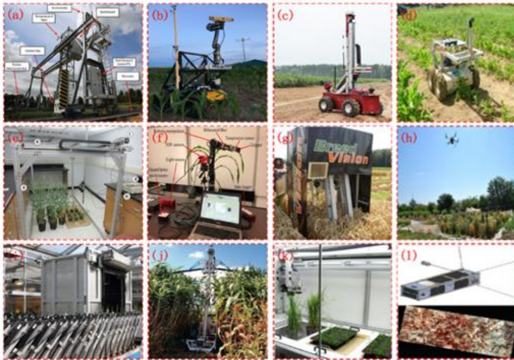
Fig. 2. Different sensor platforms for crop phenotyping: (a) robotic field platform [51] (b) Robotic platform [45], (c) Ground based platform [52] (d) Robotic platform with artificial vision [53], (e) Ground based platform [54] (f) Robotic platform [55] (g) Robotic based platform [56] (h) UAV platform [57] (i) Robotic platform [58] (j) Robotic platform [59] (k) Robotic platform [60] (l) Robotic platform [61]

irrigation systems. A sensor-based smart irrigation system for efficient water use has been developed by many businesses with the aid of advanced technology. In this system, soil moisture and temperature sensors interact directly with embedded components on the field and take care of required water distribution among crops without farmer's interaction. This system helps maintain the desired soil and the optimum water range for plant growth in the root zone. Jha et al. [62] have also developed an automated irrigation system with Arduino technology to decrease human power and time consumption in the irrigation process. The concept of an effective and automated irrigation system was also created by Savitha and Uma Maheshwari [63] by developing remote sensors using Arduino's technology that can increase output by up to 40 percent. One of the many technologies used to measure the quality of soil moisture is used by soil moisture sensors. It is buried near the crop root areas [64]. The sensors assist in assessing the moisture level accurately and relay this reading to the irrigation controller. Sensors for soil