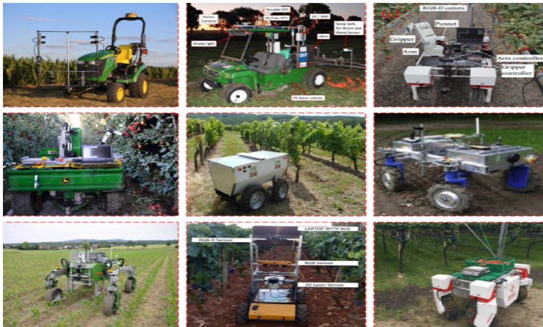
Fig. 1. Autonomous mobile robots that are used in precision farming. Fig. (a) Robotic Phenotypin [31]; (b) Agricultural robot [32]; (c) Strawberry harvesting Robot [33]; (d) Autonomous Robot (e) Robotic Apple Harvester [34]; (f) Autonomous Agriculture Robot “Vinebot” [35]; (g) Agriculture Robot Use in Field [36]; (h) Weed Removing Robot [37]; (i) Autonomous Agriculture Robot “BoniRob” [38]; (j) Agricultural Vehicle Robot [39]; (k) Agriculture Robot [40]; (l) Agriculture spraying robot [41]

A device comprising five sensors, i.e. ultrasonic distance sensors, thermal infrared radiometers, NDVI sensors, portable spectrometers, and RGB web cameras for high-throughput phenotyping in plant breeding was shown by Bai et al. [30]. These multiple sensors were used to measure crop canopy characteristics from the field plot, GPS was used to geo-refer the sensor measurements and two environmental sensors (a solar radiation sensor and air temperature/relative humidity sensor) were integrated to collect simultaneous environmental data. In the field tests, the results obtained from the soybean and wheat fields using the performance of the sensor system were satisfactory and robust.