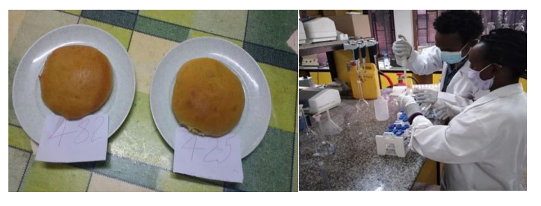
Fig. 1. Bread baking and nutritional analysis

wheat (60), sorghum (30%) and OFSP (10%). Accordingly, the study designed has been summarized in Table 1.