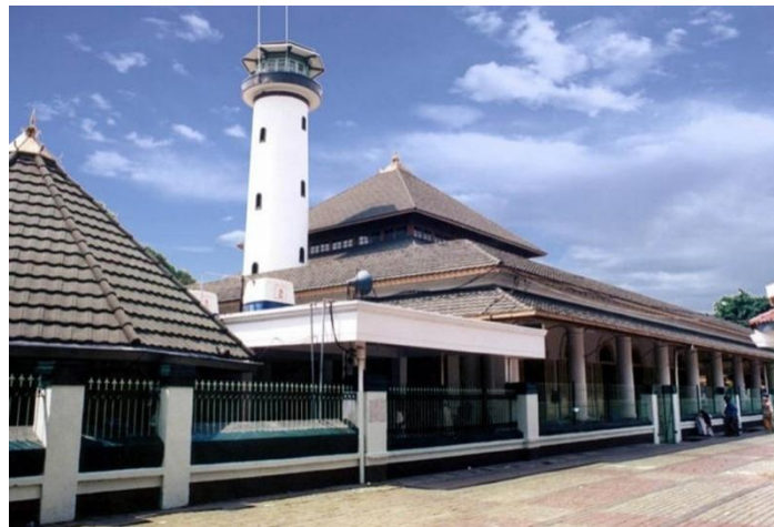
Fig. 2 The original building of the Ampel Mosque