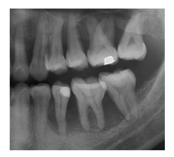
Fig. 2 Scoop-out pattern of lesion bony resorption with the preservation of alveolar crest distal to 34