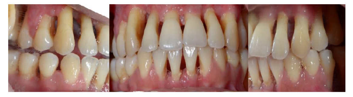
Fig. 5. Initial clinical improvement

Curettage of lesion bearing site in cases of small lesions of 2 cm or less may be sufficient leading to consequent healing making further intervention irrelevant. For massive lesion, total curettage is not recommended [6]. In cases of multiple system LCH, the principal management based is the utilization of a combination of chemotherapy regime of Vinblastine, bleomycin,