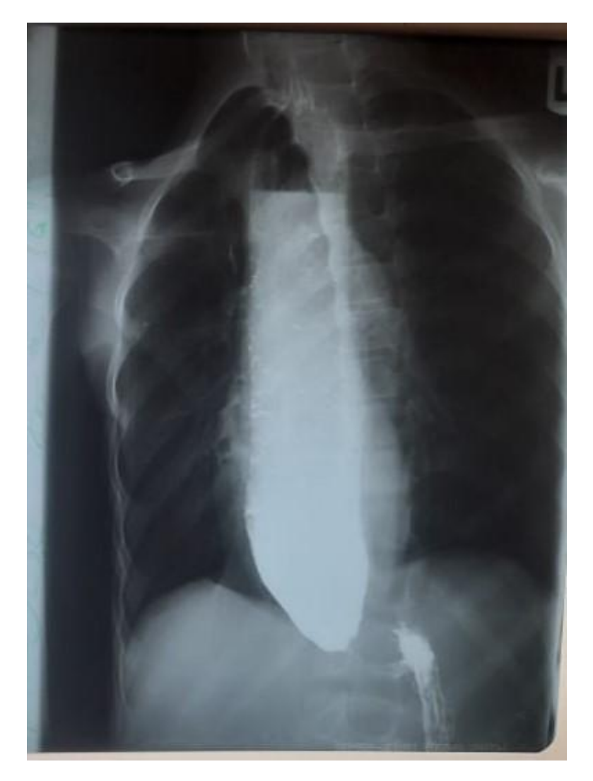
Fig. 2. Barium swallows showing the tapering of the distal oesophagus - "a typical bird's beak–like appearance"