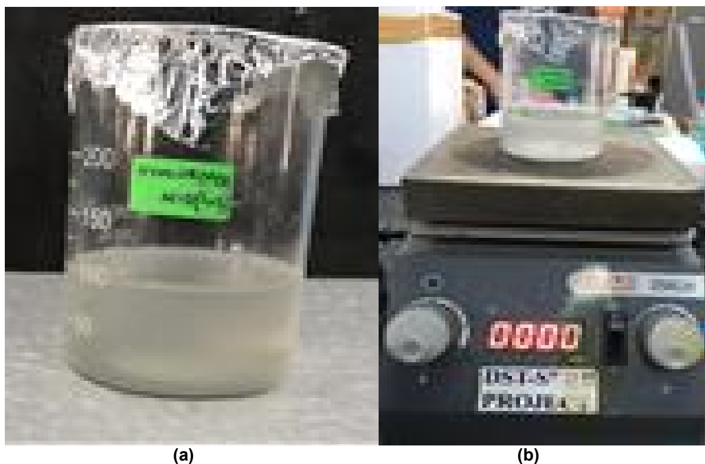
Fig. 1. Showing the synthesis of hyaluronic acid mediated zinc nanoparticle

The test for anti inflammatory properties was assessed using photometry [16]. The hyaluronic acid mediated zns are added with Bovine serum albumin and they are checked for the anti-inflammatory activity with nanoparticle concentrations 10 µL, 20 µL, 30 µL, 40 µL and 50 µL. Diclofenac sodium in different concentrations was used as standard and then incubated for 55°C for 20 min and then the result was analysed spectrometrically. There is an increased activity with the increase in the constituents. Hence they show a good anti inflammatory property [17,18] (Fig. 2).