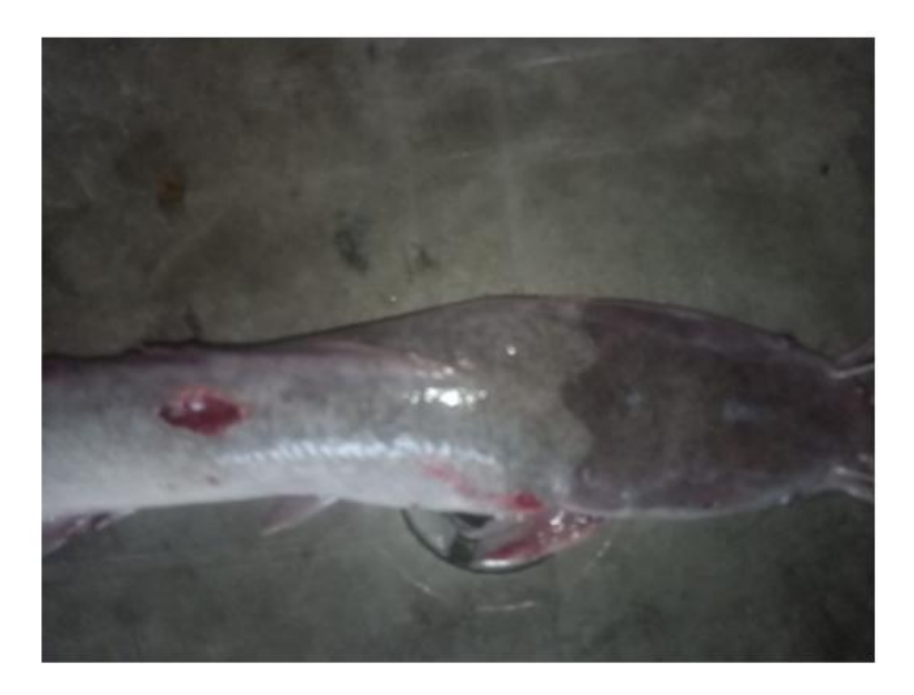
Fig. 1. Fish Fed Do and Infected with K. pneumonia

Means within the same roll with different superscripts are significantly different (p<0.05) % Surv: Percentage Survival; RSP: Relative Survival Percentage