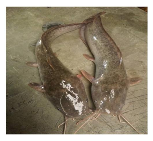
Fig. 2. Fish Fed P. americana supplemented diet and infected with K. pneumonia