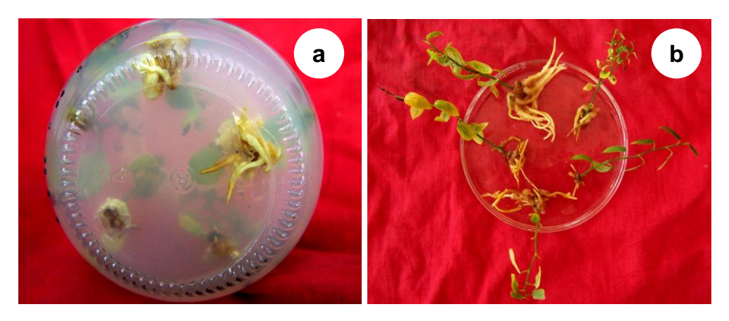
Figure 2. The in vitro induction of adventitious root in Aristolochia indica L. roots formation on semi-solid medium at (a) 21 and (b) 28 days after inoculation.

concentrations of 10.0 \mu M and their effect on rooting and root number was recorded at 21 and 28 days after inoculation (Figure 2).